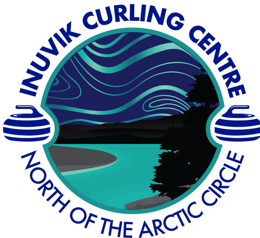
MAIN LOGO - DARK BACKGROUND